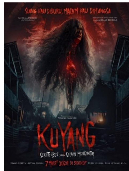
Figure 3.2 “ Kuyang ” Movie Poster