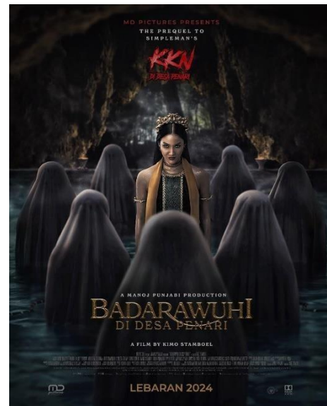
Figure 3.3 " Badarawuhi " Movie Poster