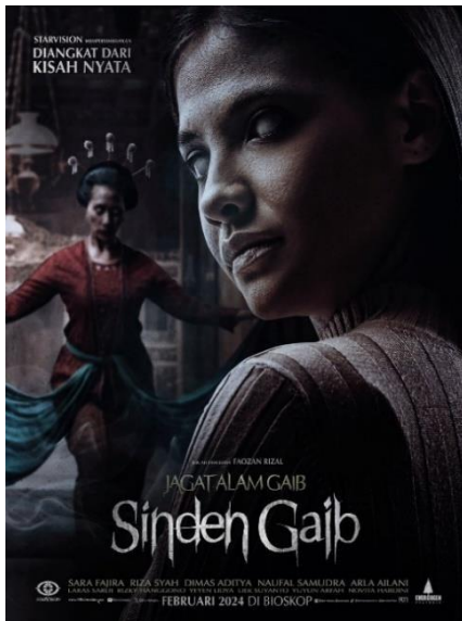
Figure 3.4 “ Siden Gaib ” Movie Poster