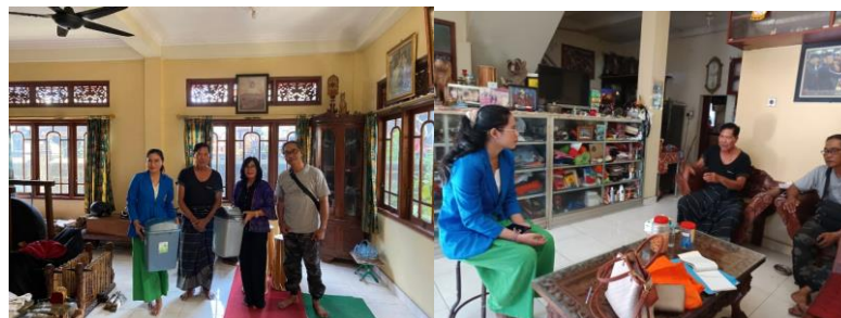
Figure 2. Visit to UD Kayumas business