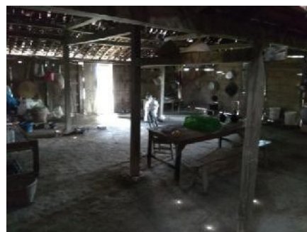
Figure 10. Past

The state of the interior in the past, especially the kitchen, still looks very simple and left behind. Inside there is a clay stove which is used as a stove for cooking.