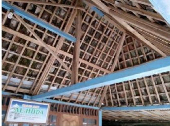
Figure 17. Present