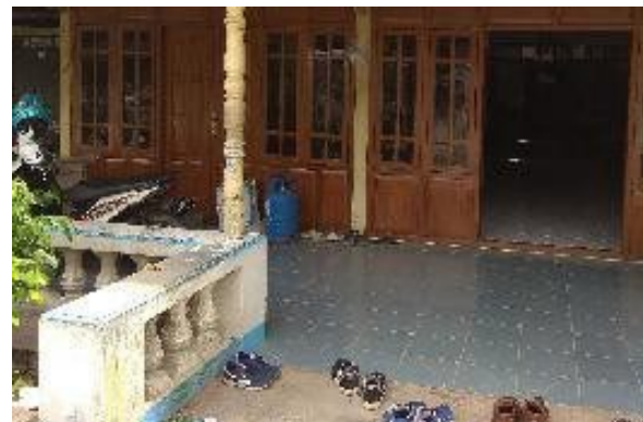
Figure 9. Present

Due to the increasingly modern era, there are also fewer Samin tribesmen who own livestock. Thus, the front room has changed its function into a place to receive guests and put a vehicle in the form of a motorbike. Meanwhile, the existing openings in the Samin tribal houses today are in the form of windows.