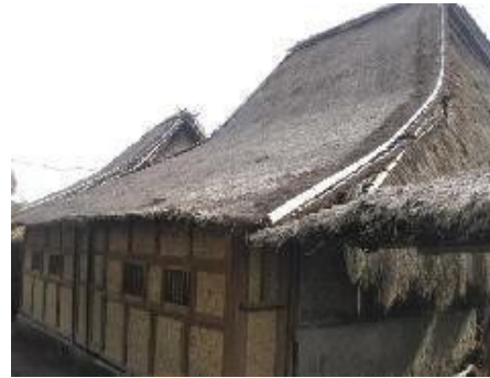
Figure 14. Past

For the house of the Samin tribe in ancient times the roof of the building was in the form of fibers which were arranged on top of the house.