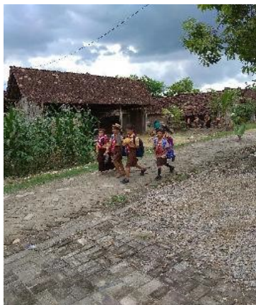
Figure 7. Present

For now, the road around the house of the Samin tribe has become modern and uses paving to cover the ground.