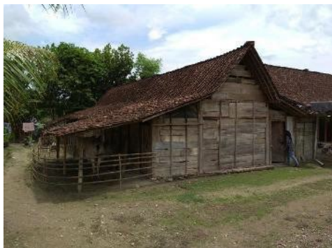
Figure 6. Past

In the past, the conditions around the houses of the Samin people were still filled with roads with dry and dusty soil, very synonymous with the impression of simplicity.