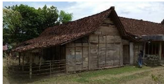
Figure 15. Present

Due to the modern era, fibers are starting to be abandoned and change direction using tiles that can last longer.