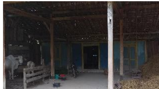
Figure 8. Past

For the past the vestibule was used for cattle pens. The opening in the past house was only a door.