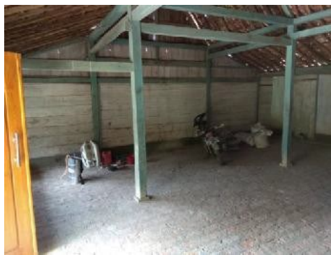
Figure 12. Past

In past Samin houses, the function of the family room was to store crops and also to store agricultural tools.