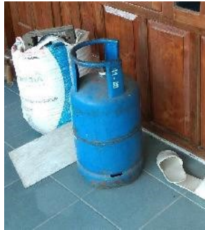
Figure 11. Present

The current state of the kitchen is very different. The situation is more modern and no longer uses clay stoves, but gas stove instead.