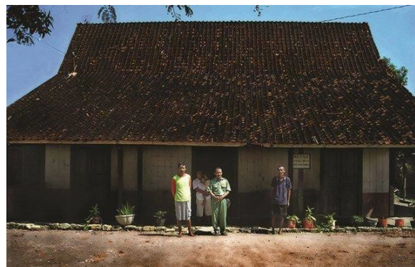
Figure 1. Example of Samin Tribe traditional house

In the architecture of the Samin tribe, their houses are made of natural materials such as wood. On the walls of the house also sometimes use the basic material of bamboo or in Javanese called gedhek . The base of the Samin tribe's house is also still using land. Not only that, the furniture in the house is very simple furniture. One example is the artificial lighting in the house of the Samin tribe use a lot of oil lamps or lanterns.