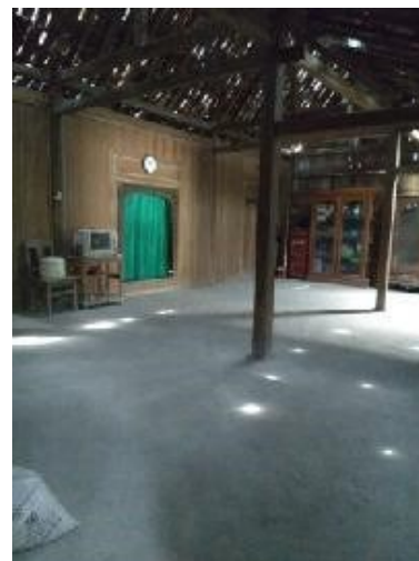
Figure 16. Past

In the old Samin house, the frame for the construction used wood and bamboo to make a pyramid roof.