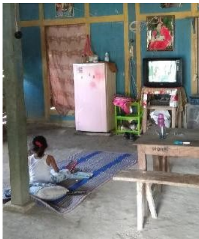
Figure 13. Present

The function of the family room is still the same as in the past, as a storage for crops. However, the difference is the presence of electricity.