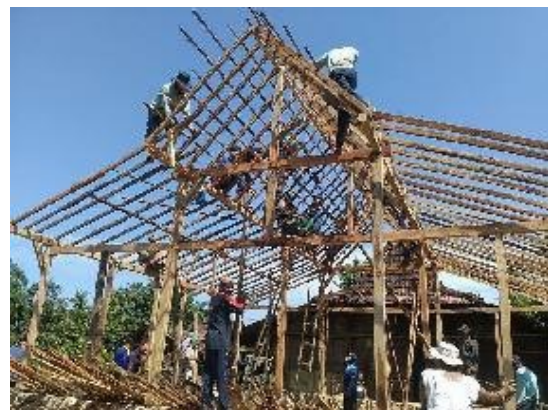
Figure 4. Past Building

In the past the process of building houses was still done together. As in the picture below, the gentlemen together lift the frame of the house structure.