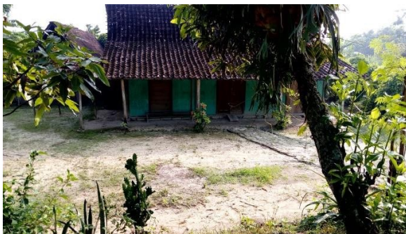
Figure 2. Example of previous Samin Tribe traditional house