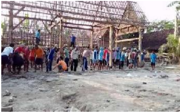
Figure 5. Present

Not much different from the past, the development process at present still maintains the principle of mutual cooperation in the process. And usually the craftsmen come from the Samin tribe itself.